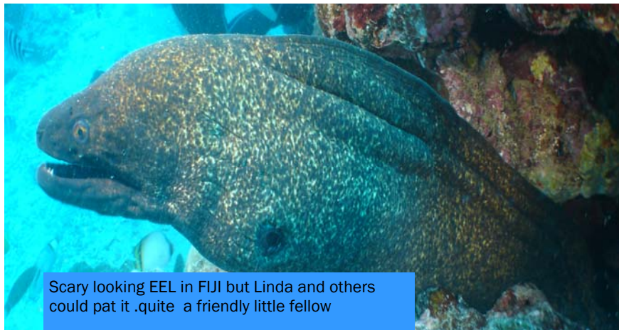
Scary looking EEL in FIJI but Linda and others could pat it .quite a friendly little fellow