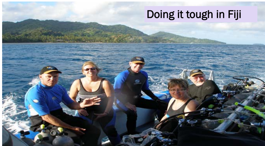
Doing it tough in Fiji

Fiji is about 4 to 5 hours from Melbourne it has 300 +islands the main being Viti Levu. These islands are part of a volcanic chain that starts in new guinea and ends in NZ.