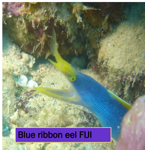
Blue ribbon eel FIJI