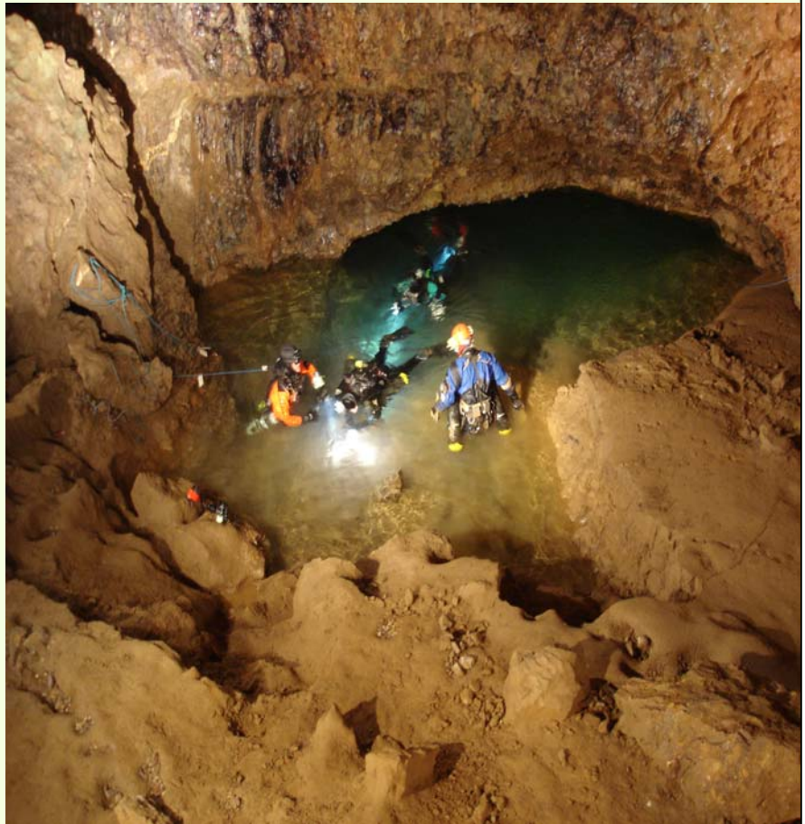
Divers in Chamber 9 prepare to exit the water