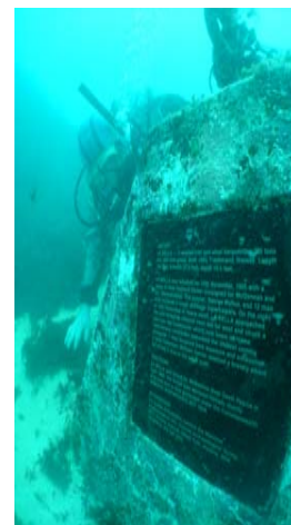
Jeff cottrill looking at La Bella Wreck