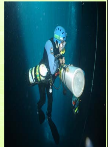
Another Mt Gambier Amazing Experience