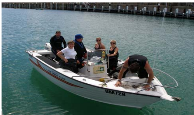
Club members returning from another great dive. December 2007